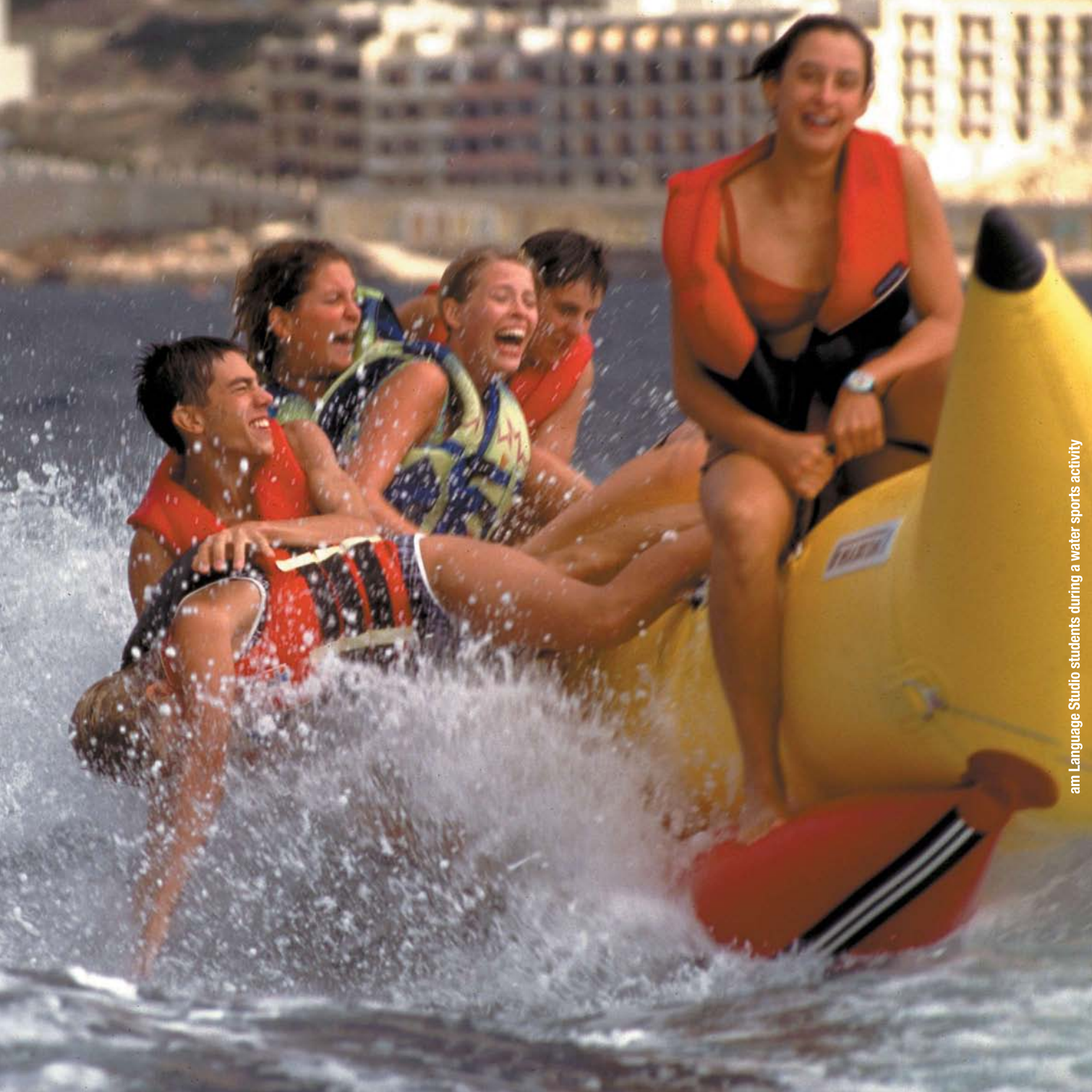
am Language Studio students during a water sports activity