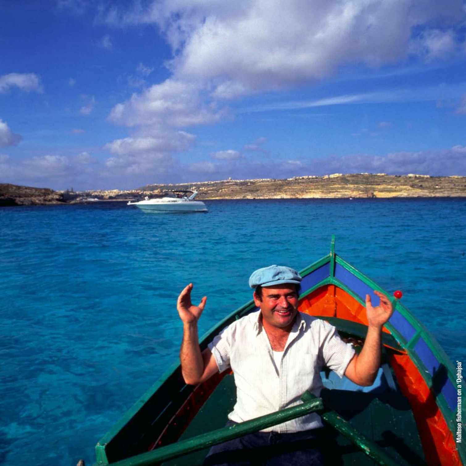
Maltese fisherman on a 'dghajsa'