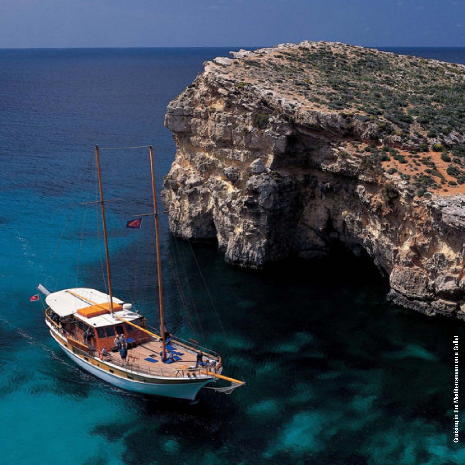
Cruising in the Mediterranean on a Gullet