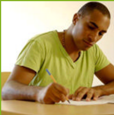
Tuition at am Language Studio

All our teachers are fully qualified and licensed by the Ministry of Education. Although experienced, we promote enthusiasm and new ideas as part of our Teaching Philosophy.