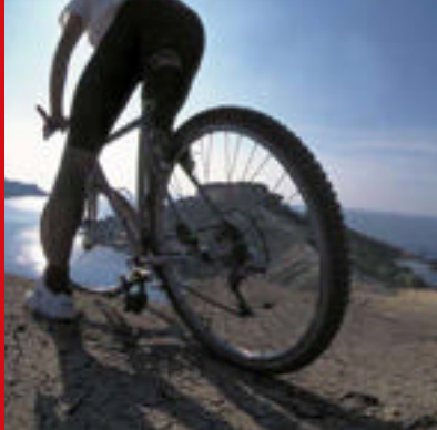
Cycling in Malta