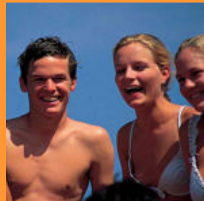
am Language Studio students at the beach