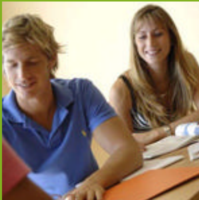
Tuition at am Language Studio

If you're looking for a course that will effectively emphasise the four components of successful language use that are Listening, Speaking, Reading and Writing, then your search is over!