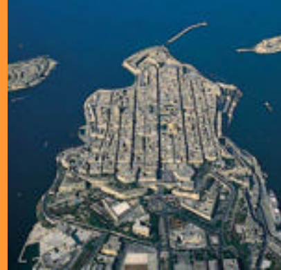
Arial view of Valletta