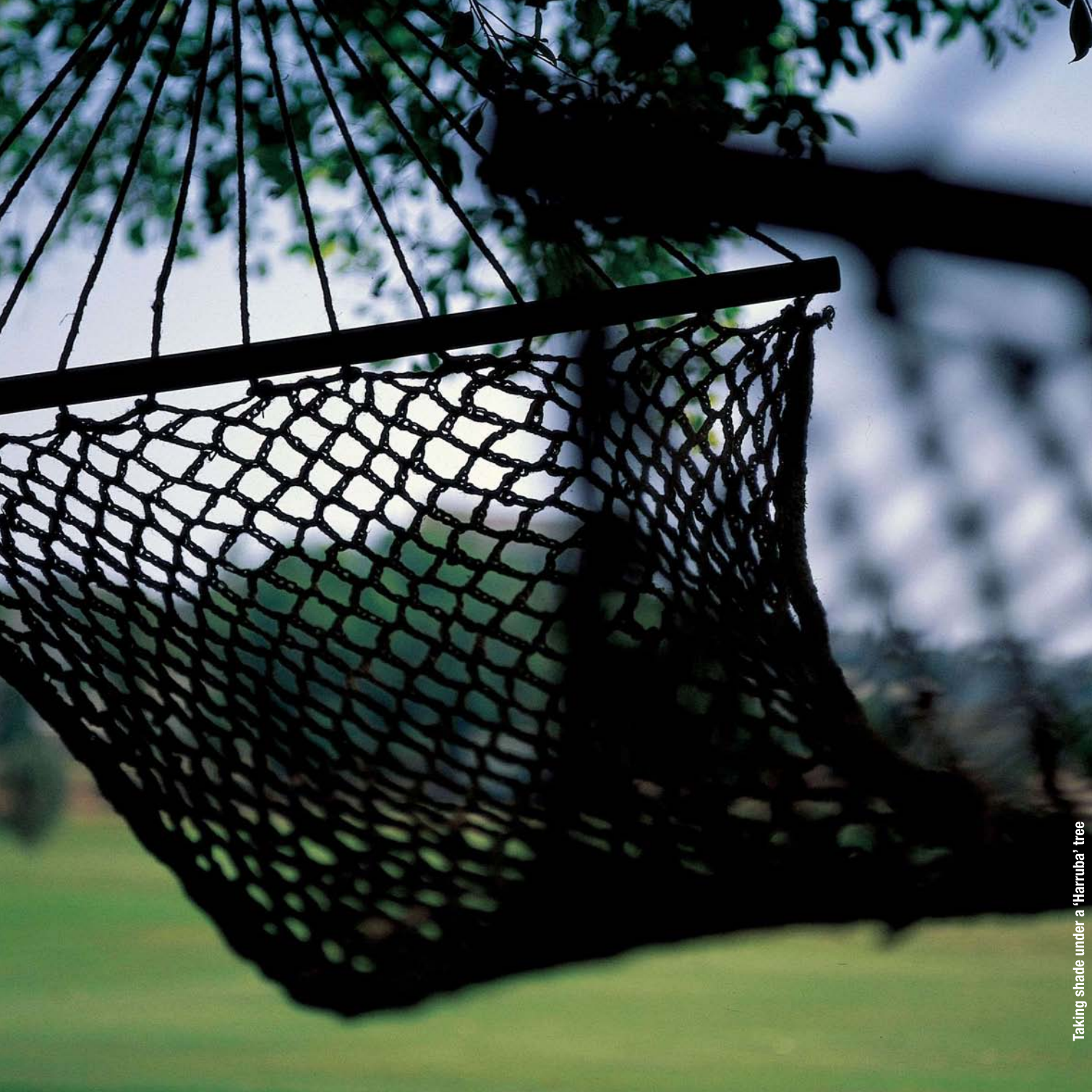
Taking shade under a 'Harruba' tree