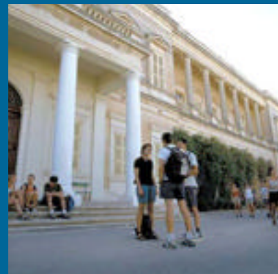
am Language Studio Convent of The Sacred Heart - St. Julians