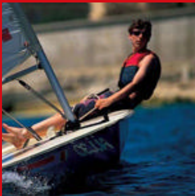
Sailing in Malta