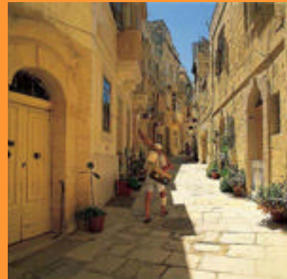
Maltese Village Street

“ In Malta people speak English... ...in Malta the sun is shining. ”