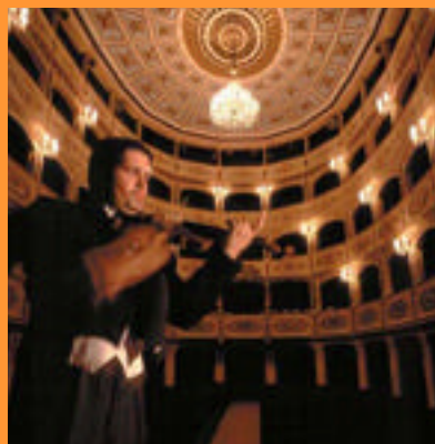
The Manoel Theatre - Valletta

With more than 7,000 years of history Malta will open a window to the past. The Phoenicians, the Romans, the Normans, the Arabs, the Knights of Saint John, the French and the British have all come for a while. So should you!